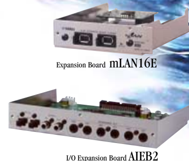
Expansion Board mLAN16E